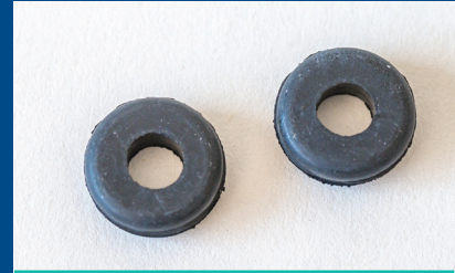
2 x Rubber grommets