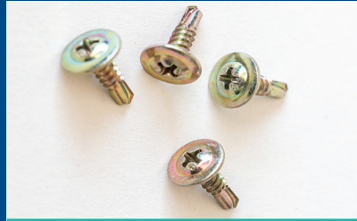
4 x Self-tapping screws