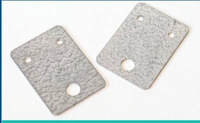
2 x Metal plates